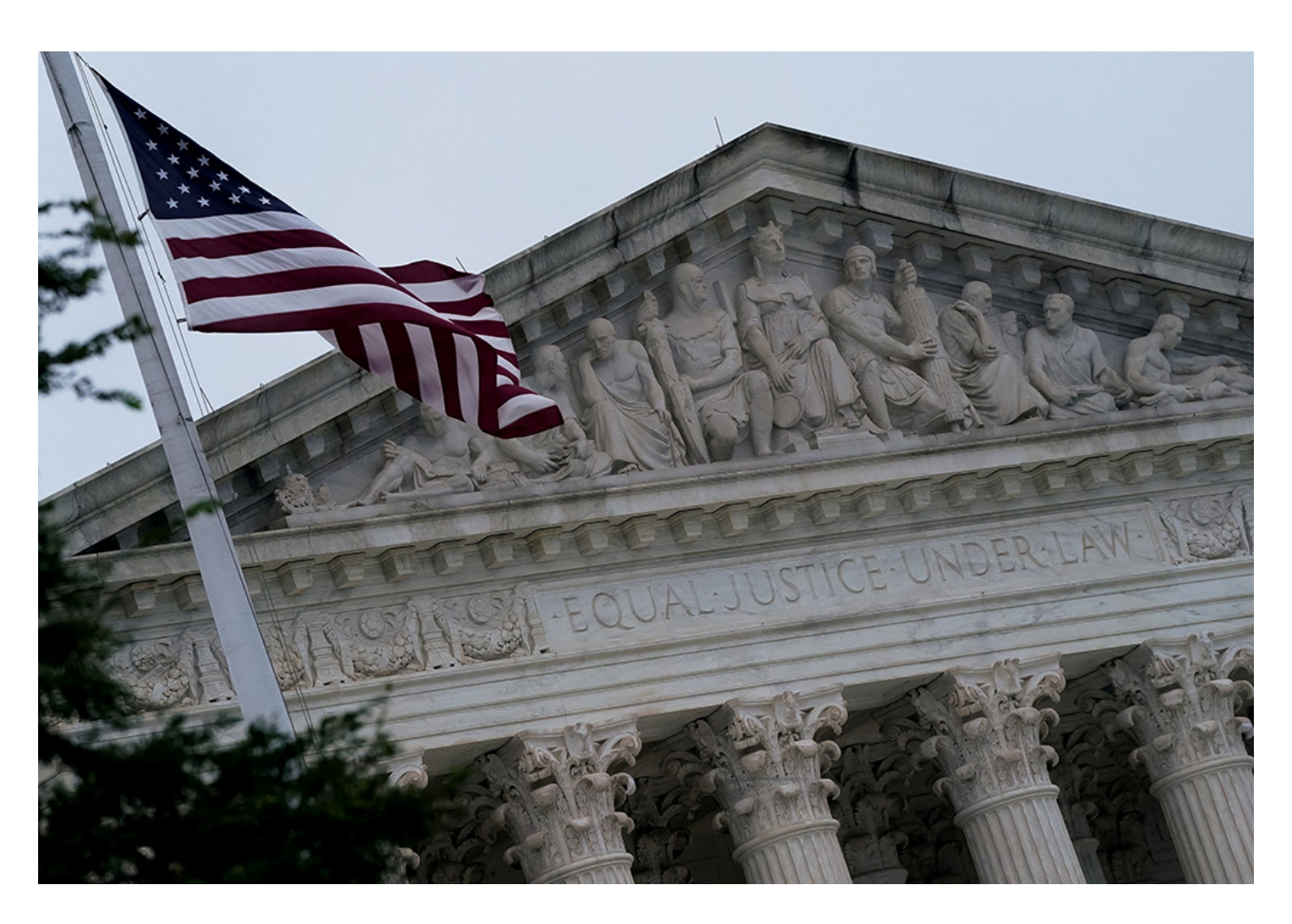
The U.S. Supreme Court building is seen Oct. 2 in Washington.

A group Leo founded, The 85 Fund, also gave $250,000 to Students for Fair Admissions, the nonprofit arguing for an end to affirmative action policies at Harvard University and the University of North Carolina in a <a href="mailto:case">case</a> now before the U.S. Supreme Court.