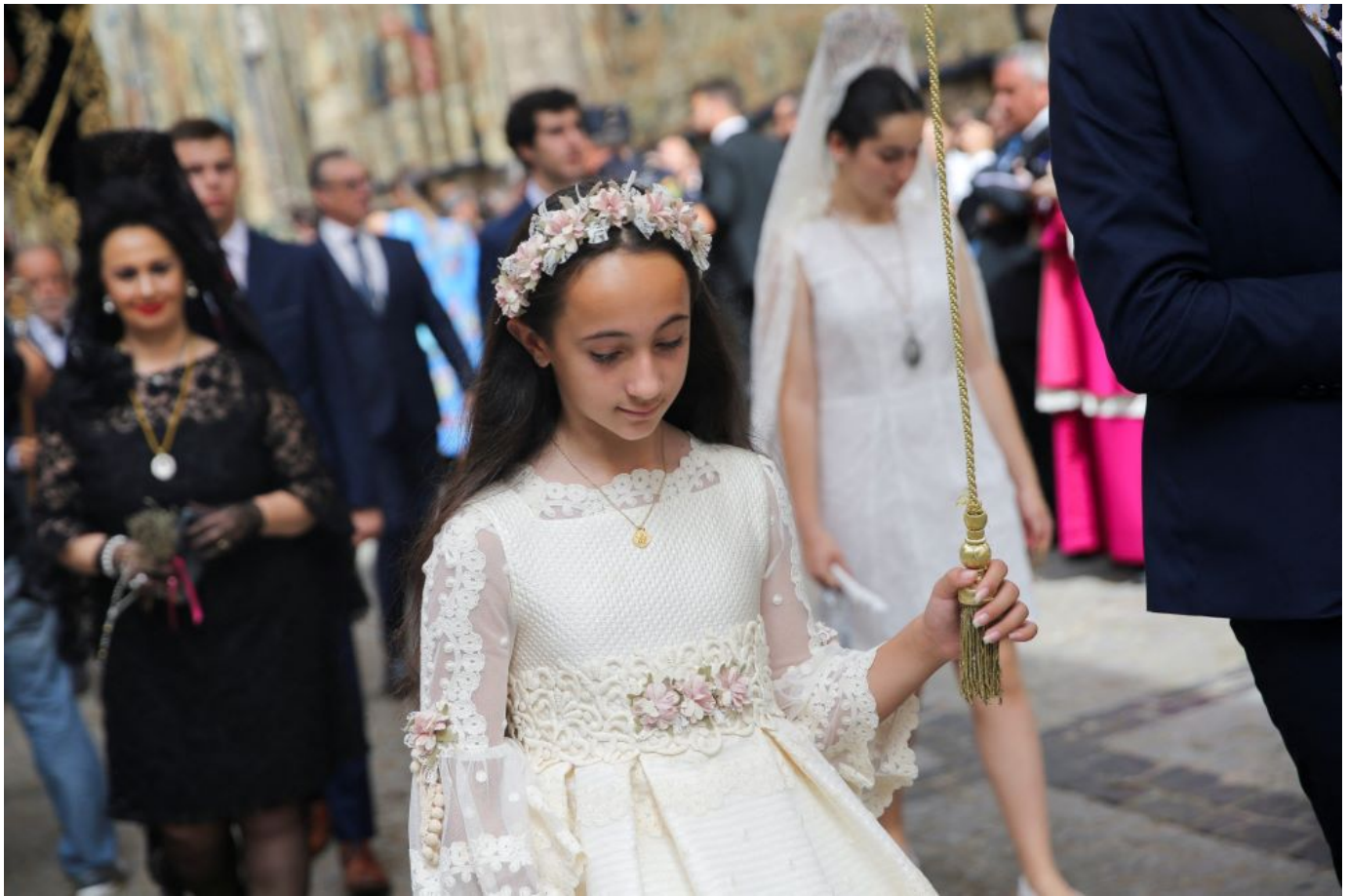
A young woman takes part in a procession on the feast of Corpus Christi in Toledo, Spain, June 16, 2022.

In their Jan. 13 statement , the Catholic bishops urged Spaniards to reflect on the "great transformation" now affecting their society, listing recent moves they said prioritize the "absolute power of the individual," in ways "totally contrary to reason, nature and life."