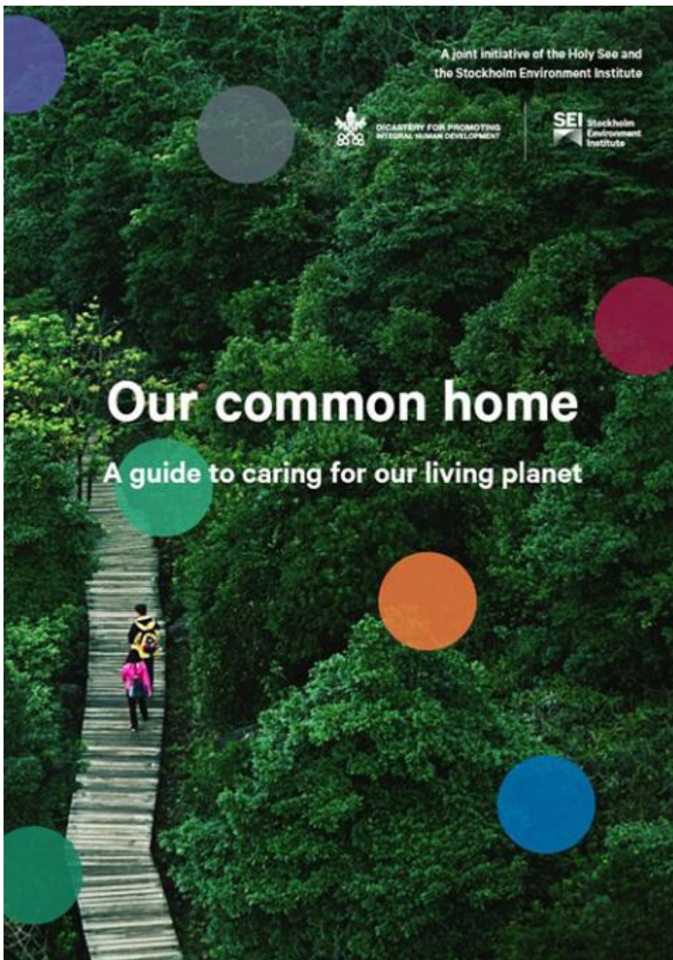
The cover of "Our Common Home: A Guide to Caring for Our Living Planet"

For each, it offers a summary of the topic paired with a passage from " Laudato Si' , on Care for Our Common Home" — Francis' 2015 encyclical on ecology — along with brief descriptions of what is required to address the problem and suggested reflections and action steps for people to take.