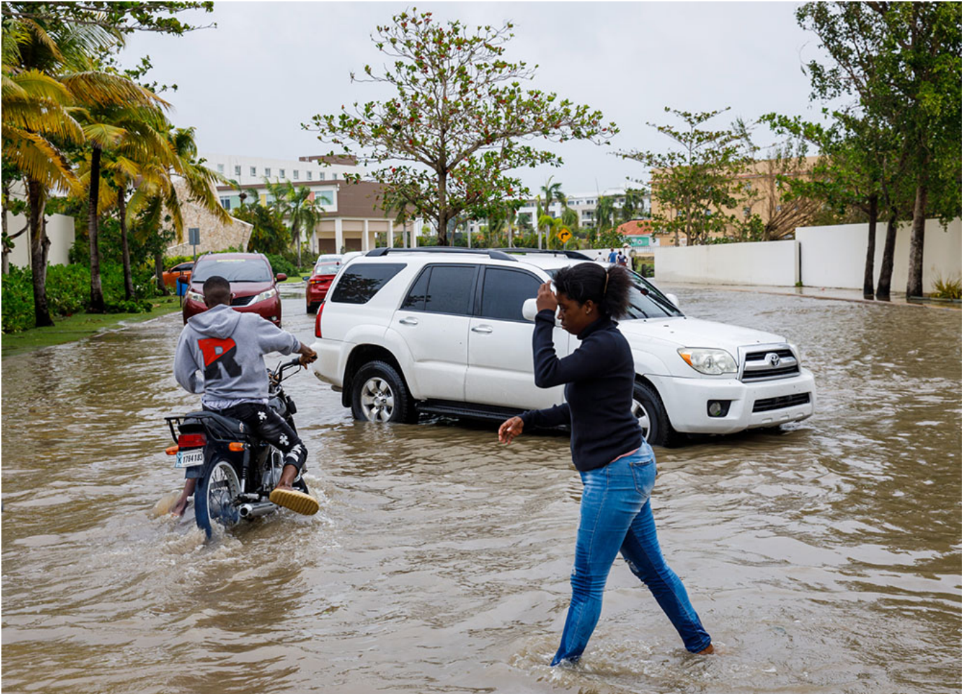
A flooded street is seen Sept. 19, 2022, in Bávaro, Punta Cana, Dominican Republic, in the aftermath of Hurricane Fiona.