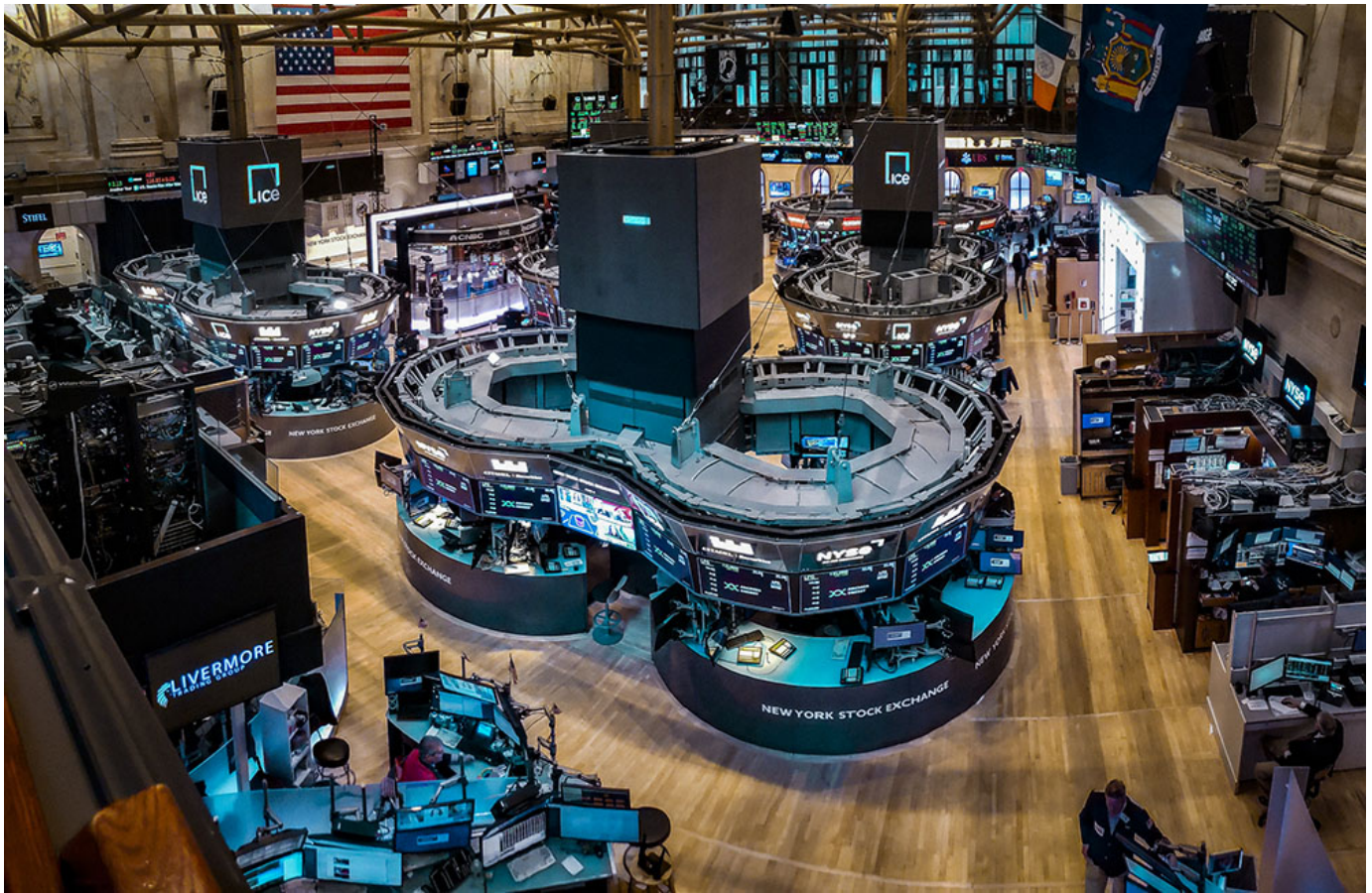
A view of the trading floor at the New York Stock Exchange in 2022

"I don't think it's determinative in terms of the changes of votes," Smith said of the anti-ESG efforts. "It's one factor of half a dozen."