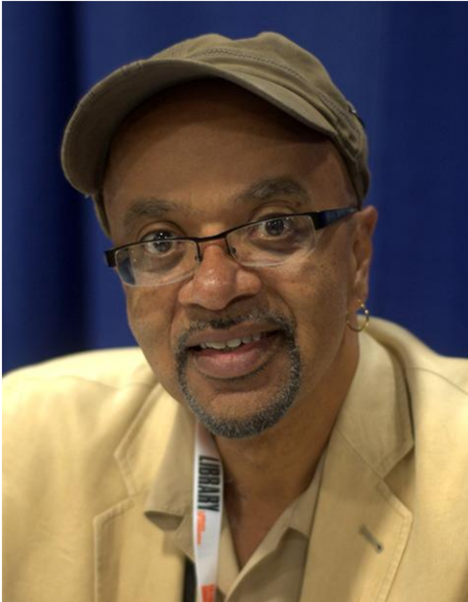
James McBride, author of The Heaven & Earth Grocery Store

After all, the title of McBride's best-selling debut memoir, The Color of Water — about his sprawling, biracial, Christian and Jewish, Northern and Southern family — comes from his mother's response when young James asks "whether God was black or white." And McBride's second book, the World War II novel Miracle at St. Anna , is set in motion by an object resting on a table as if "God had placed it there, which He, in fact, had."