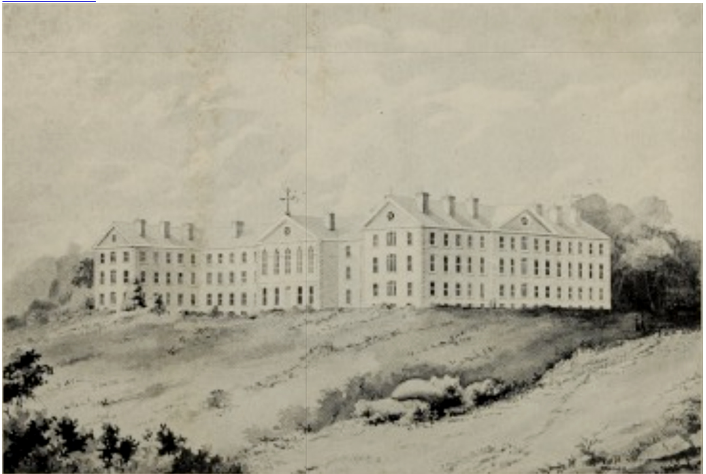
Drawing of Woodstock College in Woodstock, Maryland, in 1871