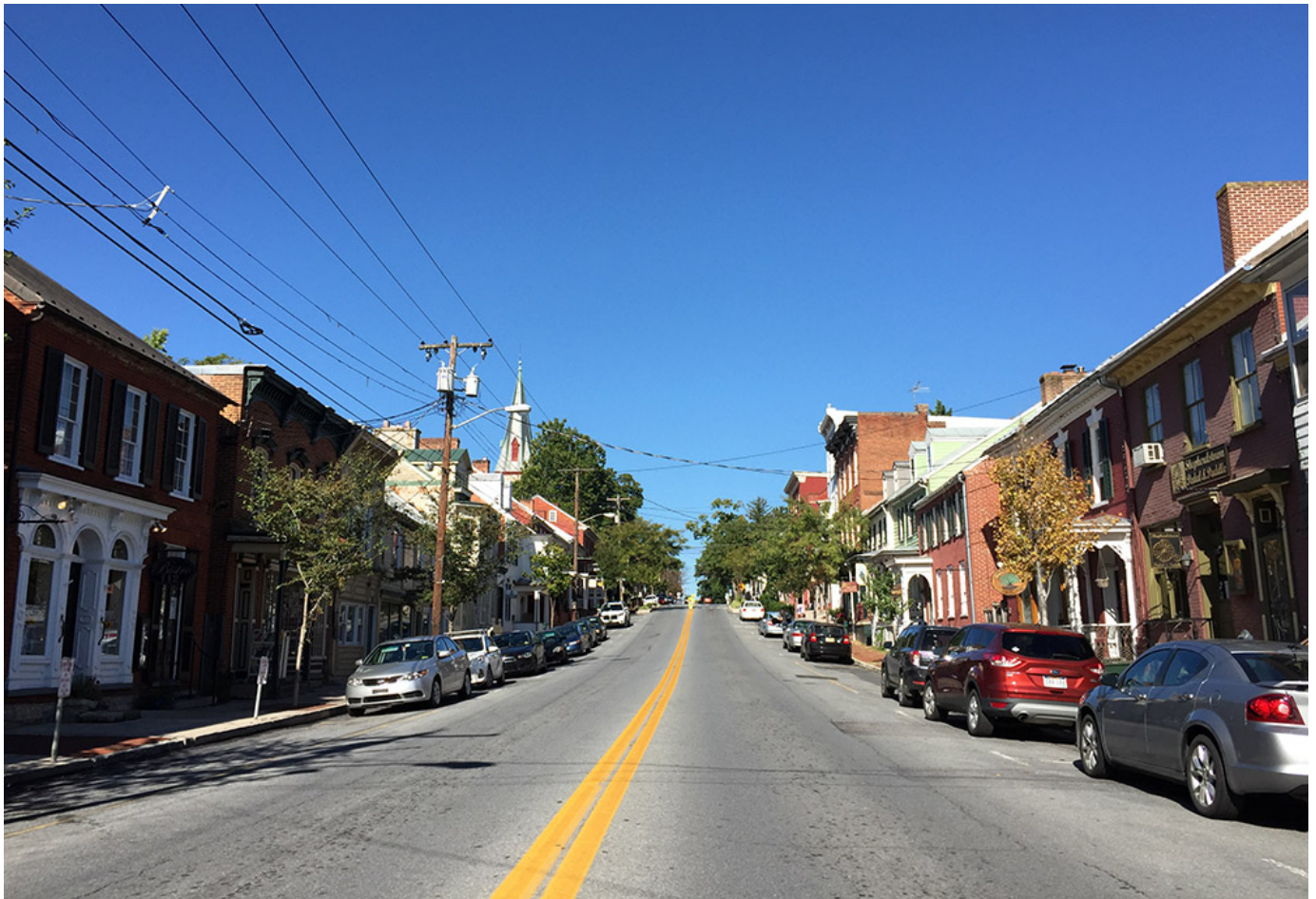
View of a street in Shepherdstown, West Virginia