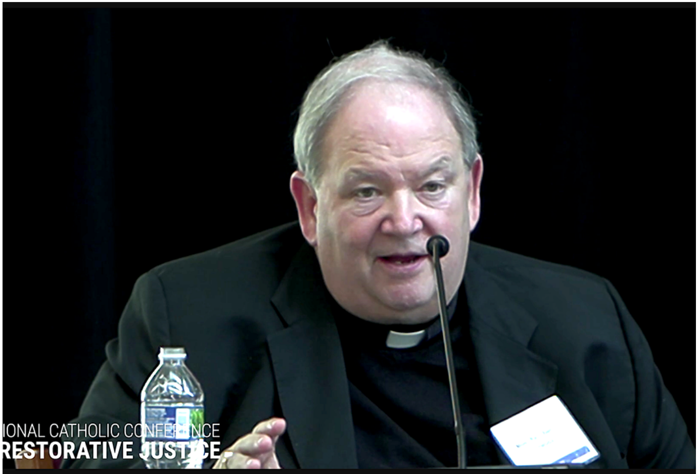
Archbishop Bernard Hebda of St. Paul and Minneapolis speaks Oct. 6 at the National Catholic Conference on Restorative Justice in Minneapolis.

But truly listening to survivors can bring transformation.