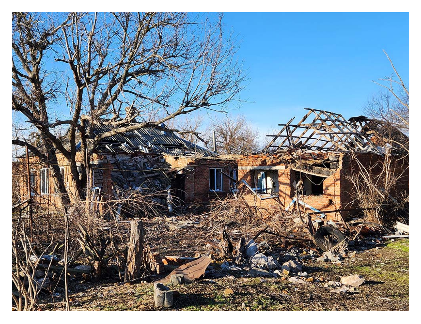
One of many damaged homes in the eastern Ukrainian village of Preobrazhenka

Such heartbreak is widespread, said Stawnychy of Caritas, noting that in Ukraine, a cornerstone of a family's safety net is owning a home, whether in a city or a village like Preobrazhenka.