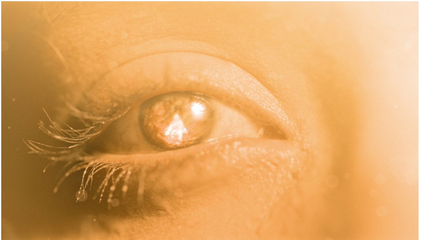
A still from the movie "After Death"