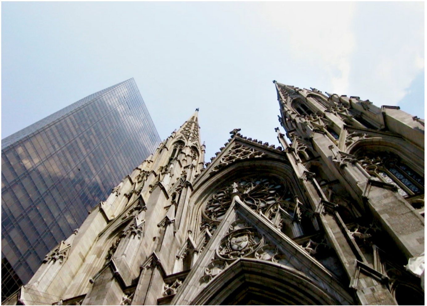
St. Patrick's Cathedral in Manhattan, New York

The New York Archdiocese discovers there's gold in those Manhattan skyscraper canyons. It is looking to sell the air rights to its valued midtown properties. Meanwhile, on the ground, Dorothy Day's parish church and other now-shuttered properties are up for sale .