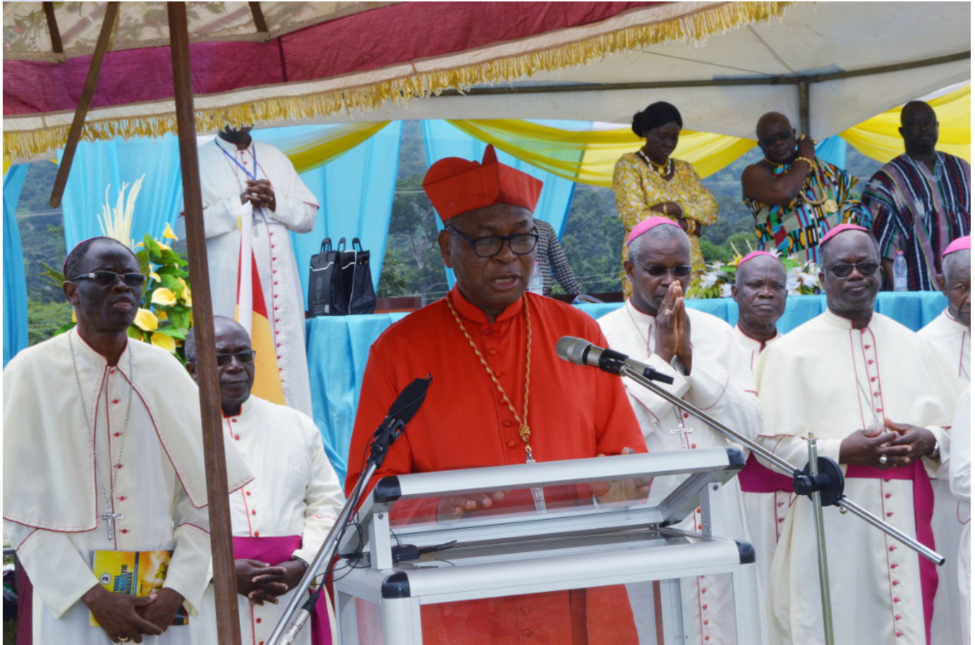
Nigerian Cardinal John Olorunfemi Onaiyekan is seen at the Fourth National Eucharistic Congress in Jasikan, Ghana, Aug. 11. This year marks the 60th year of Ghana's independence.