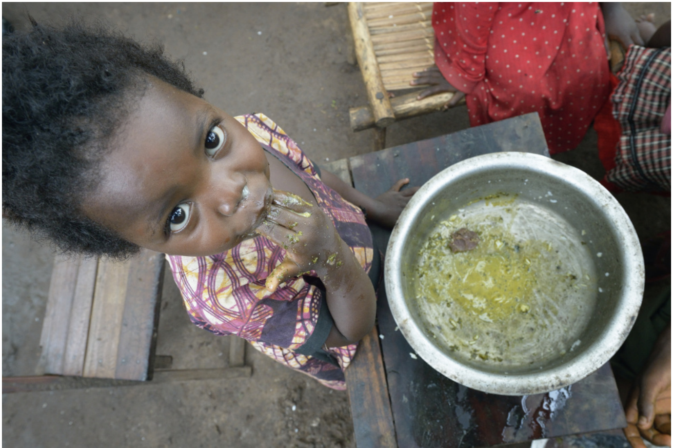
A 2-year-old girl eats a meal in an internally displaced camp in Riimenze, South Sudan, April 29.