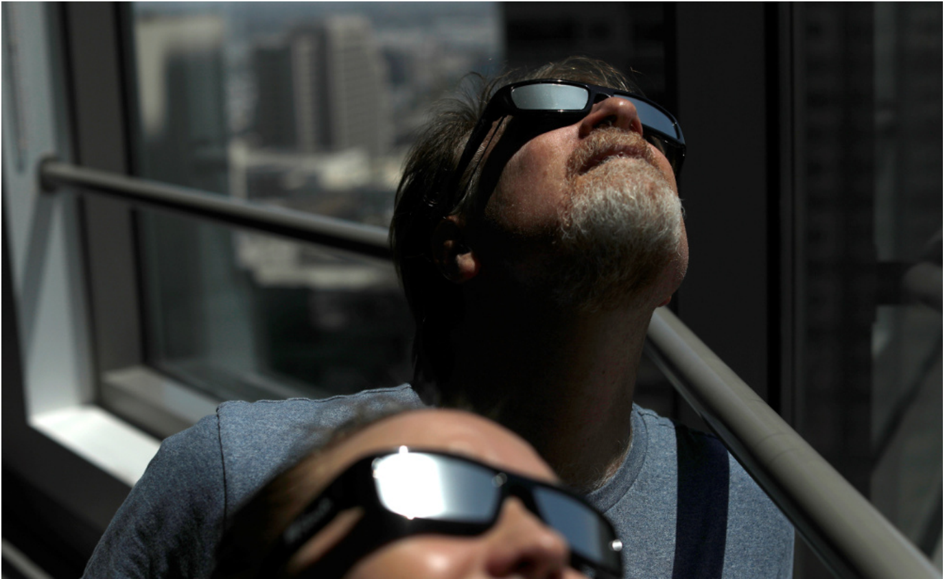
People wearing solar eclipse sunglasses are seen in Los Angeles Aug. 8.