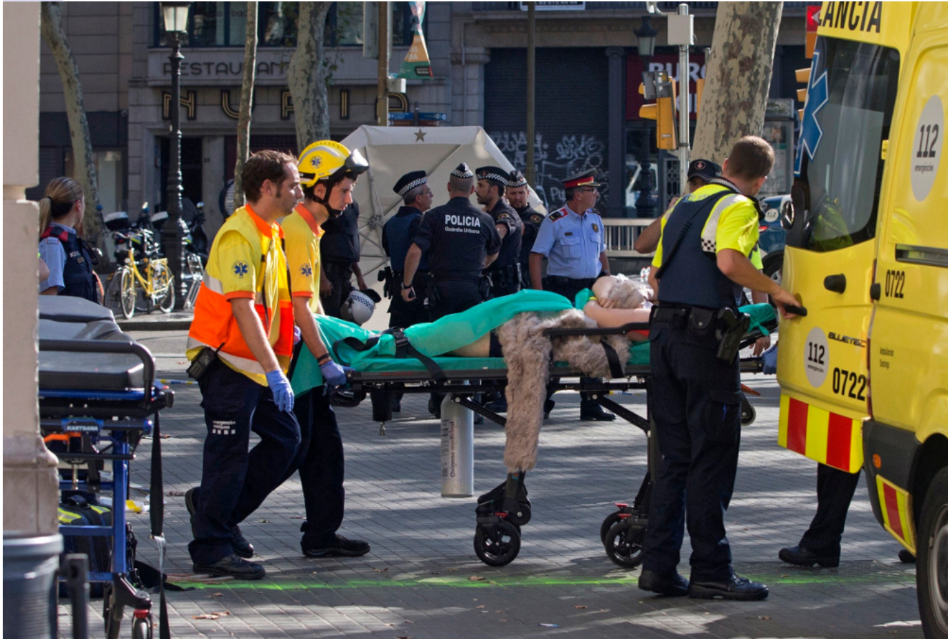
Medics move an injured person after a van crashed into pedestrians in the Las Ramblas district of Barcelona, Spain, Aug. 17.