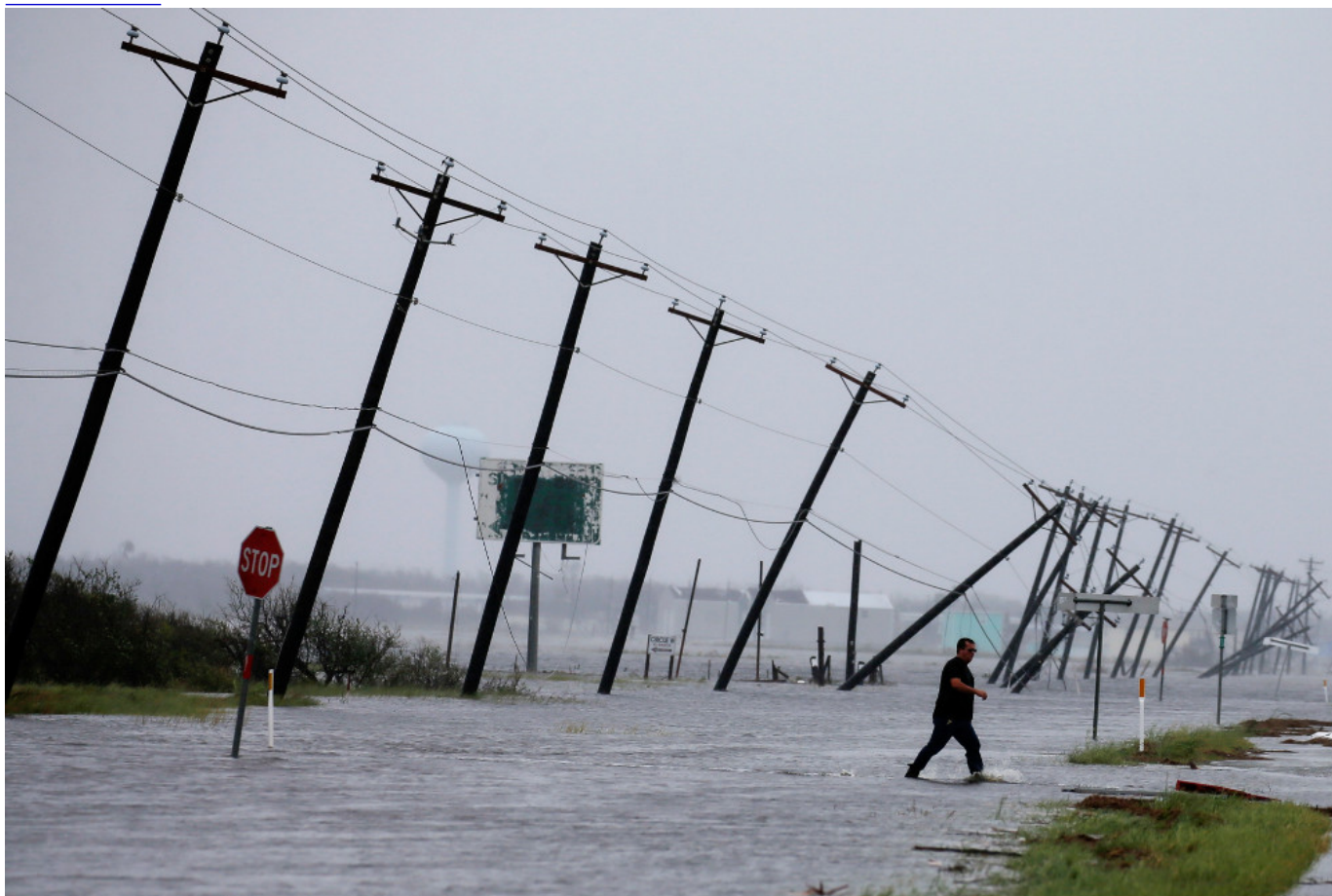
A man walks through floods waters and onto the main road Aug. 26 after surveying his property which was hit by Hurricane Harvey in Rockport, Texas.