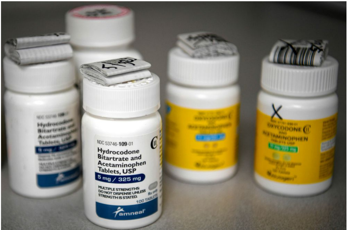
Bottles of opioid-based medication at a pharmacy in Portsmouth, Ohio

The foundation of human flourishing — dignified participation in and labor for a stable community — should be the shared basis of social life, rather than the aspirational perks of a high-powered career.