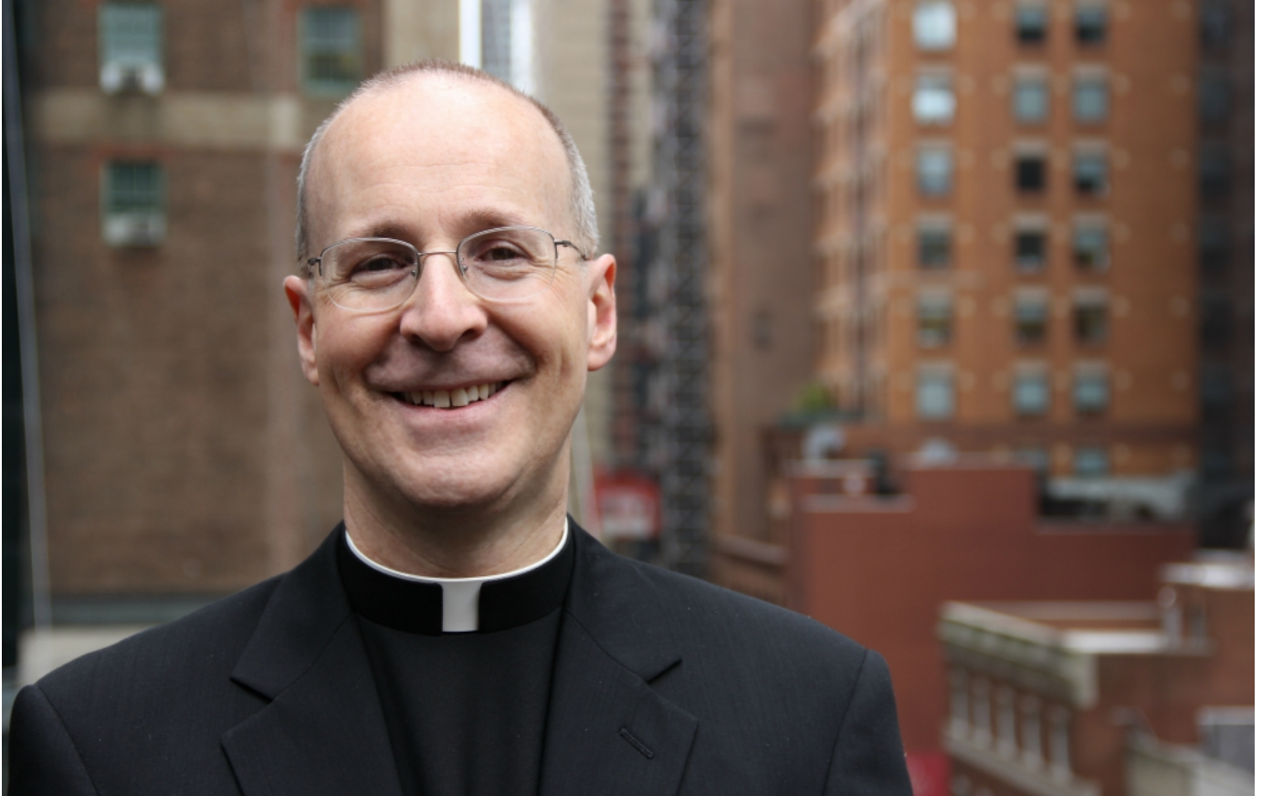
Jesuit Fr. James Martin