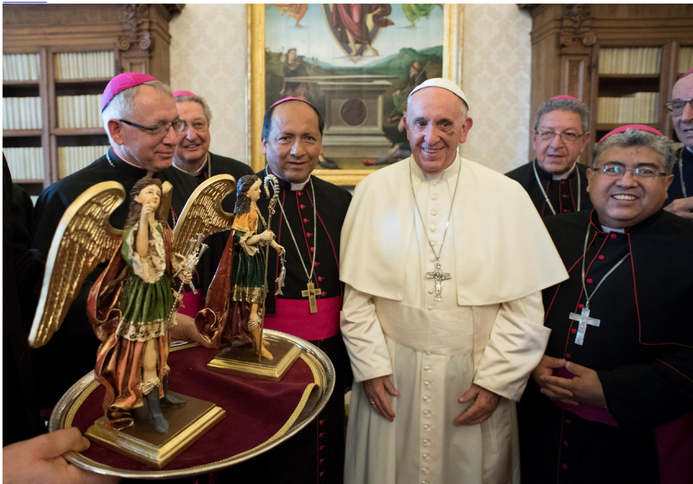
Pope Francis poses with members of the Bolivian bishops' conference during a Sept. 18 meeting at the Vatican.