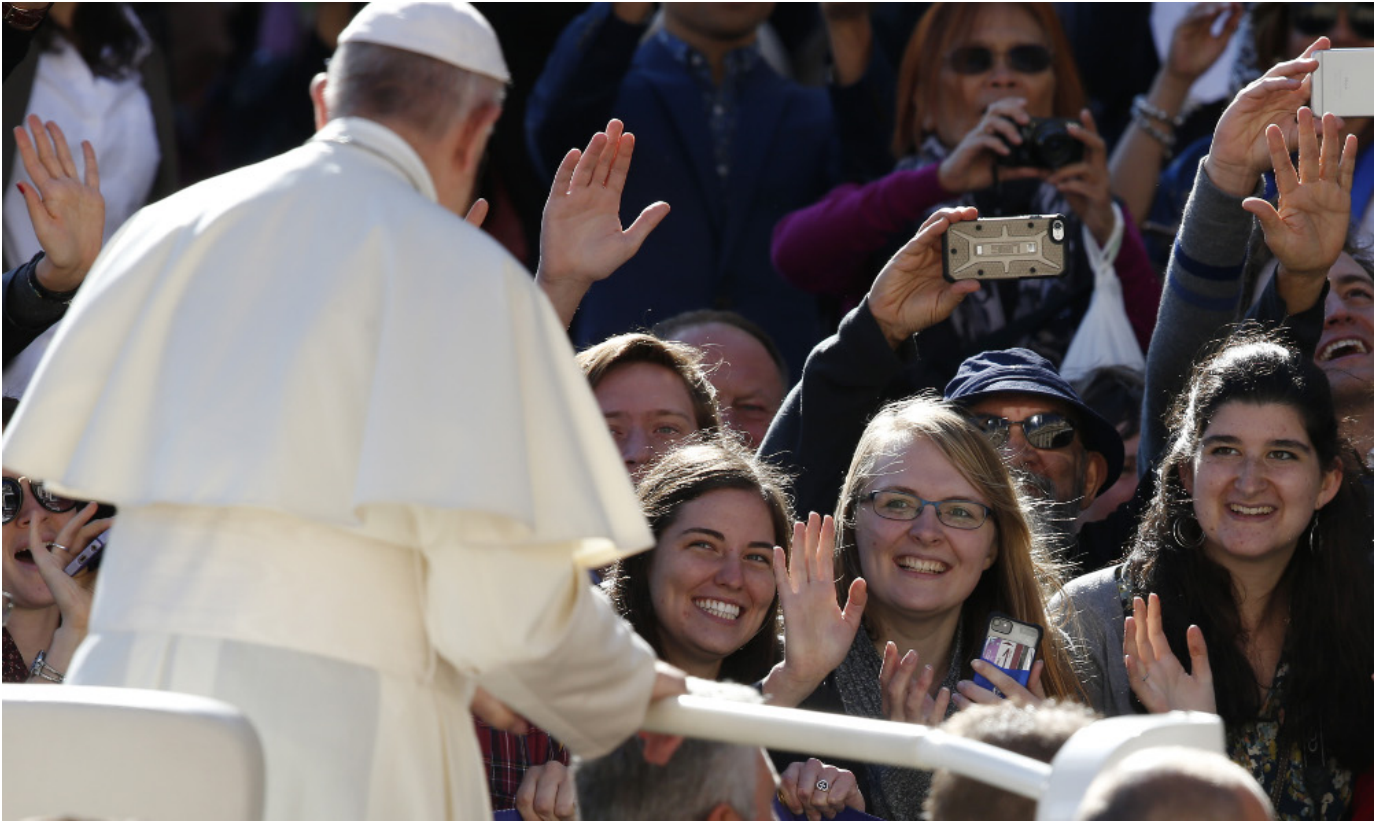
Young people wave as Pope Francis greets the crowd during his general audience in St. Peter's Square at the Vatican Sept. 20.