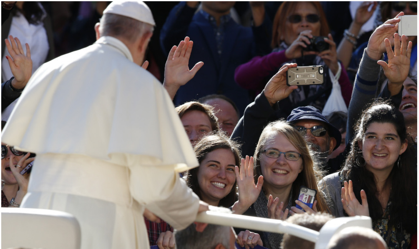
Young people wave as Pope Francis greets the crowd during his general audience in St. Peter's Square at the Vatican Sept. 20.

— If fear or evil looms so large it seems insurmountable, remember "that Jesus lives in you. And, through you, it is he, who, with his meekness, wants to subdue all enemies of humanity: sin, hatred, crime and violence."