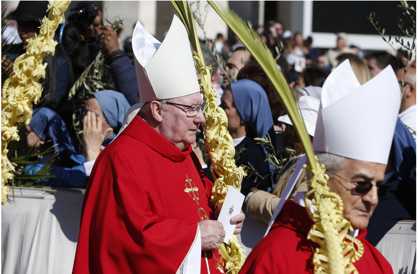
Cardinal Kevin Farrell of the Dicastery for Laity, Family and Life, center, carries a palm frond in procession during Palm Sunday Mass celebrated by Pope Francis in St. Peter's Square at the Vatican April 9.