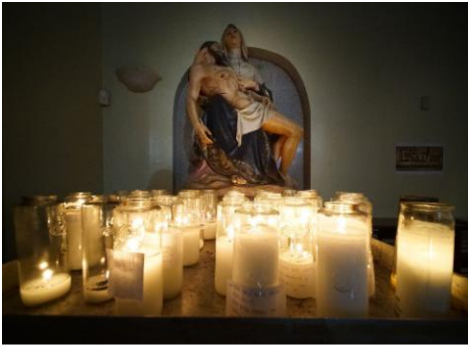
Candles flicker in the Dulce Nombre de Maria Cathedral Basilica in Hagatña, Guam.

For some on Guam, the turmoil calls into question what it means to be Chamorro on an island where religion is for many inseparable from indigenous culture.