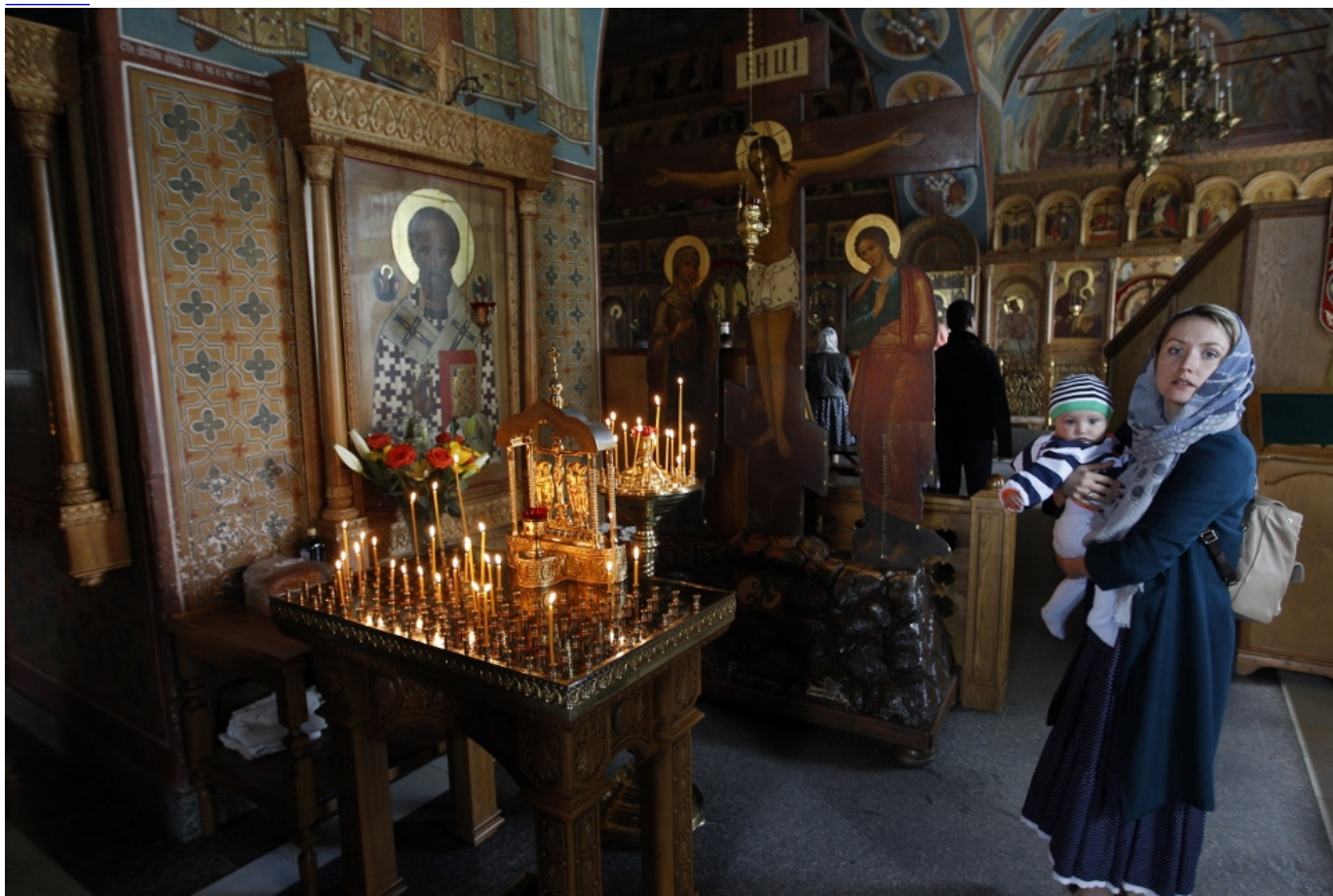
A young Russian Orthodox woman holds her child in a church at Optina Monastery May 27.