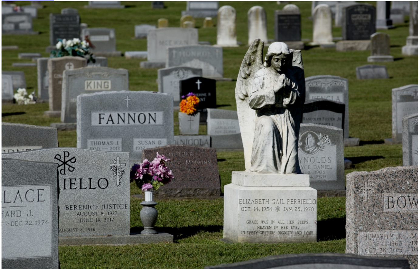
St. Mary Parish's cemetery in Alexandria, Virginia