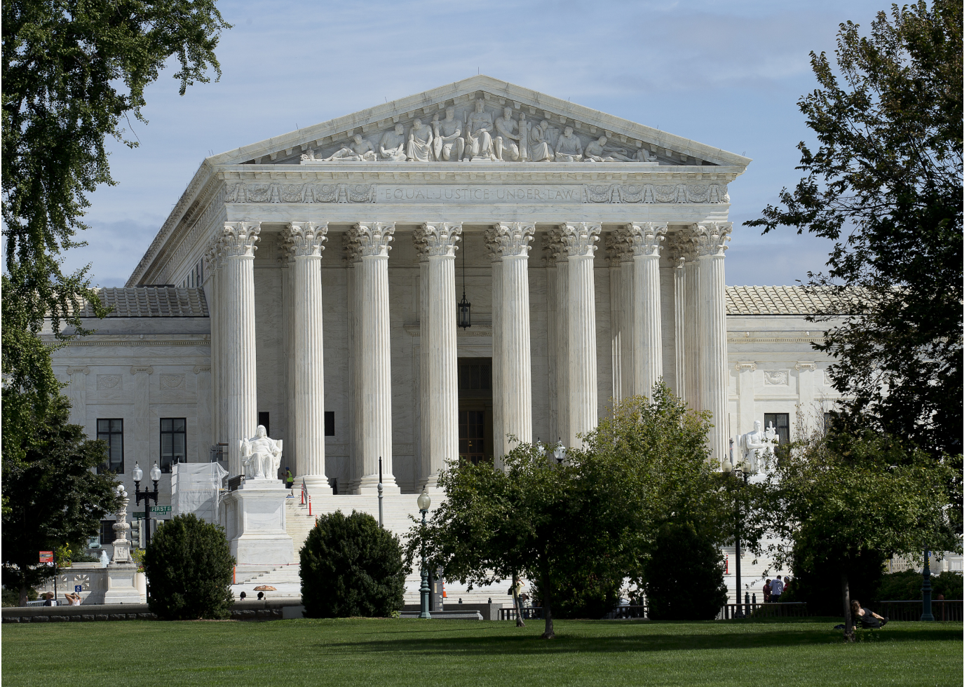
The U.S. Supreme Court is seen in Washington Sept. 26.