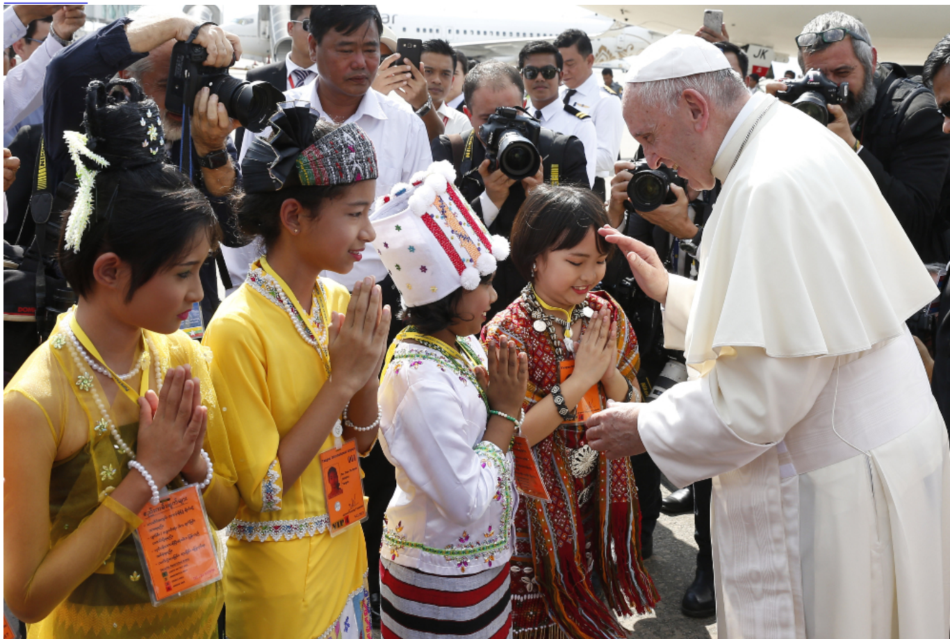
Pope Francis greets children as he arrives at Yangon International Airport in Yangon, Myanmar, Nov. 27.