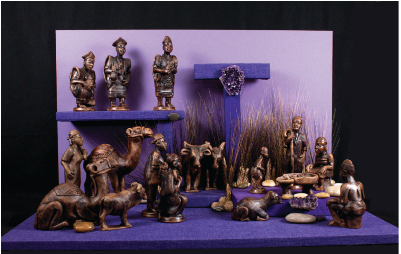
This set of 17 pieces of dark brown ceramic was crafted at one of the three handicraft centers run by the Presbyterian Church in Cameroon.