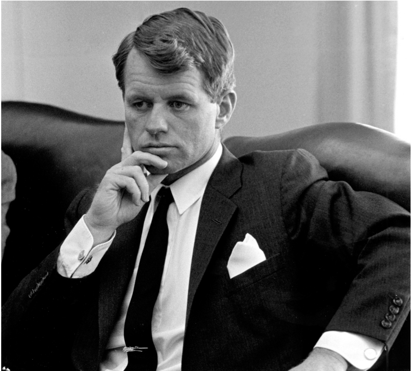
Robert F. Kennedy in 1964