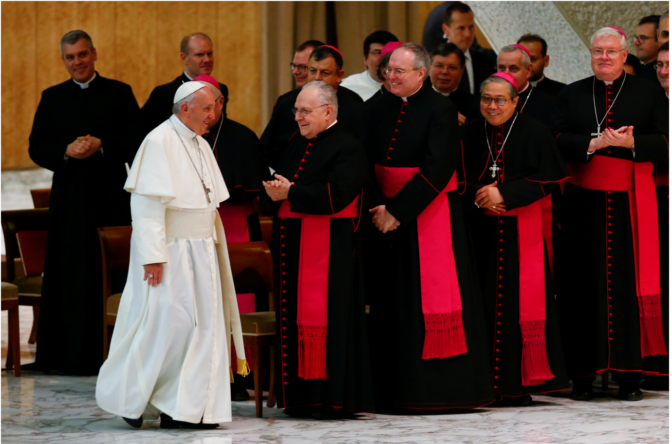
Pope Francis arrives to lead his general audience in Paul VI hall at the Vatican Dec. 13.