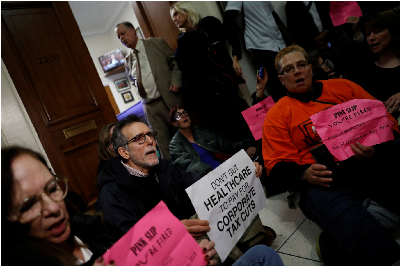
Demonstrators protest against the tax bill outside the office of Rep. Dana Rohrabacher, R-Calif., Dec. 5 on Capitol Hill in Washington.