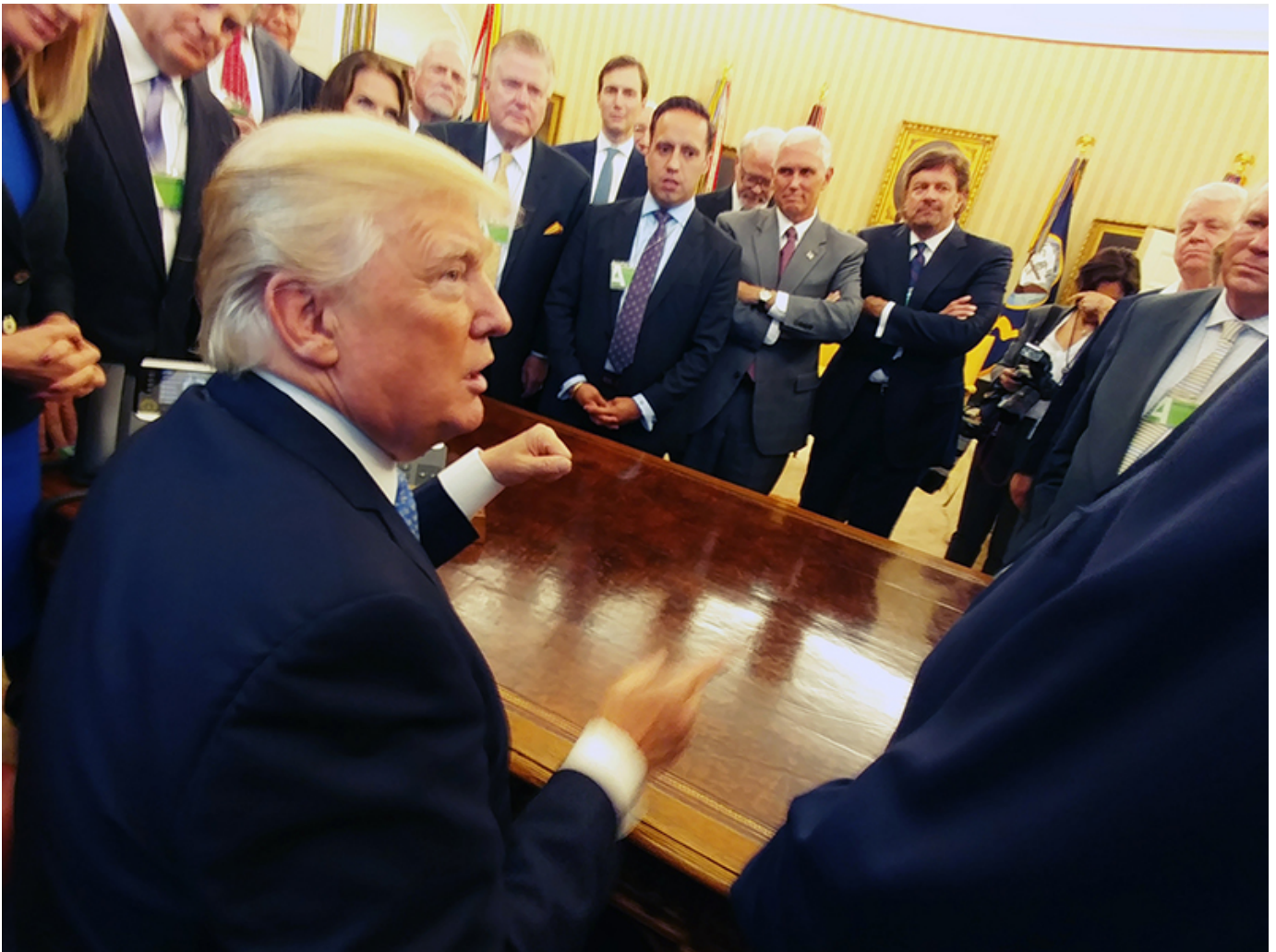
President Trump meets with faith leaders inside the Oval Office on May 3, 2017.