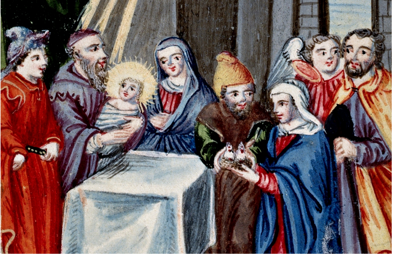
Detail of a 16th-century miniature of the Presentation of Jesus at the Temple