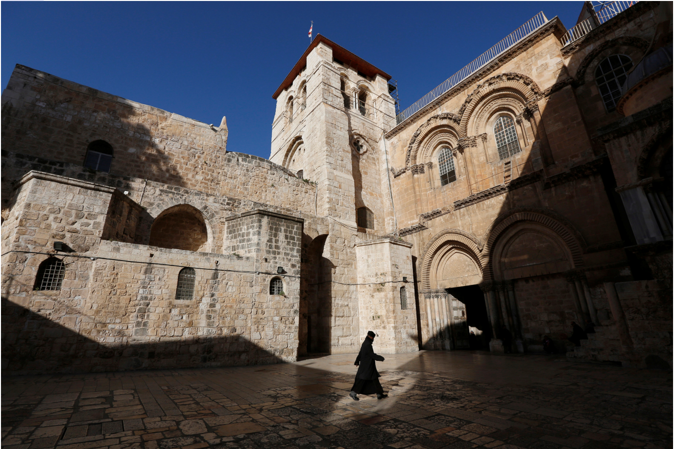
A monk walks outside Jerusalem's Church of the Holy Sepulcher in 2013.