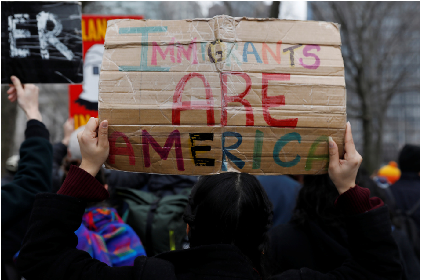
Activists and DACA recipients are seen in New York City Feb. 15.