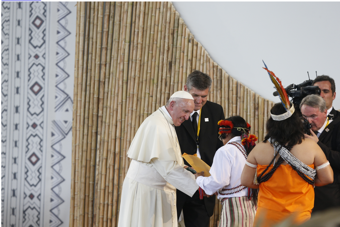
Pope Francis meets members of an indigenous group from the Amazon region during his visit to Peru in January.