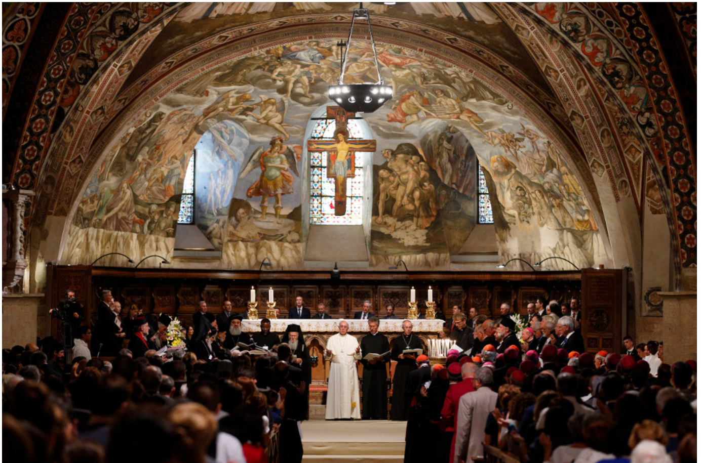
Pope Francis presides at an ecumenical prayer service with religious leaders in the Basilica of St. Francis in Assisi, Italy, Sept. 20, 2016. The pope and other religious leaders participated in the service that marked the 30th anniversary of St. John Paul II's Assisi interfaith peace gathering.