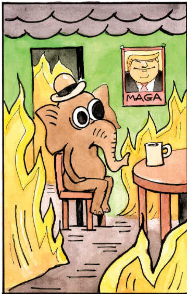
M. WUERKER WITH APOLOGUES TO K.C. GREEN