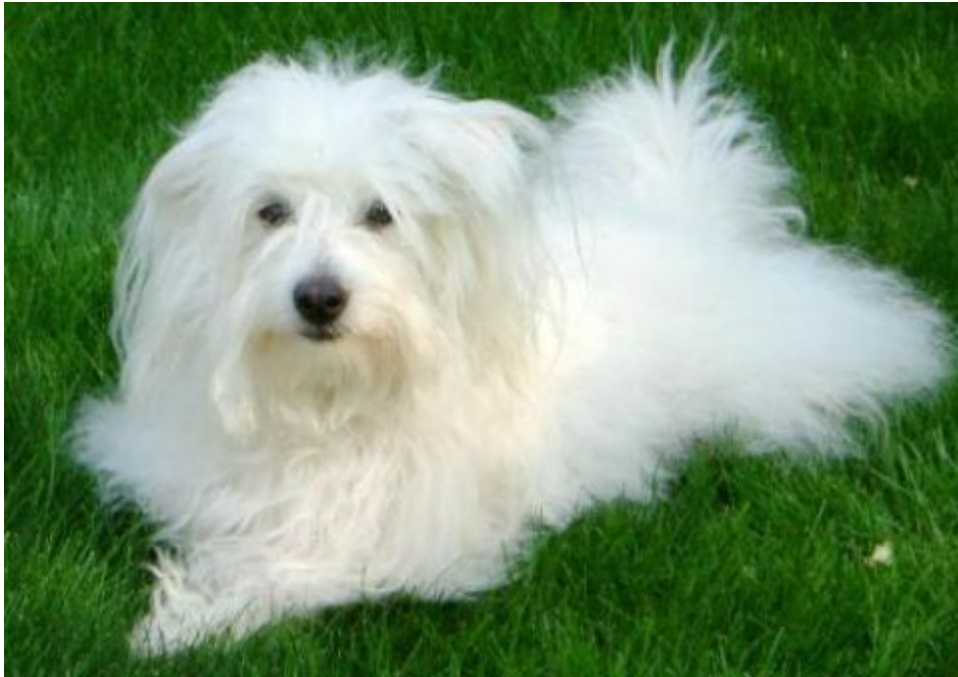
Coton de Tular dog

Somewhere, someplace, some scientist is cloning something. They've cloned cattle, cats, deer, horses, mules, oxen, rabbits and rats. Recently, they've cloned monkeys in China. Can cloning Uncle Fred be far behind?