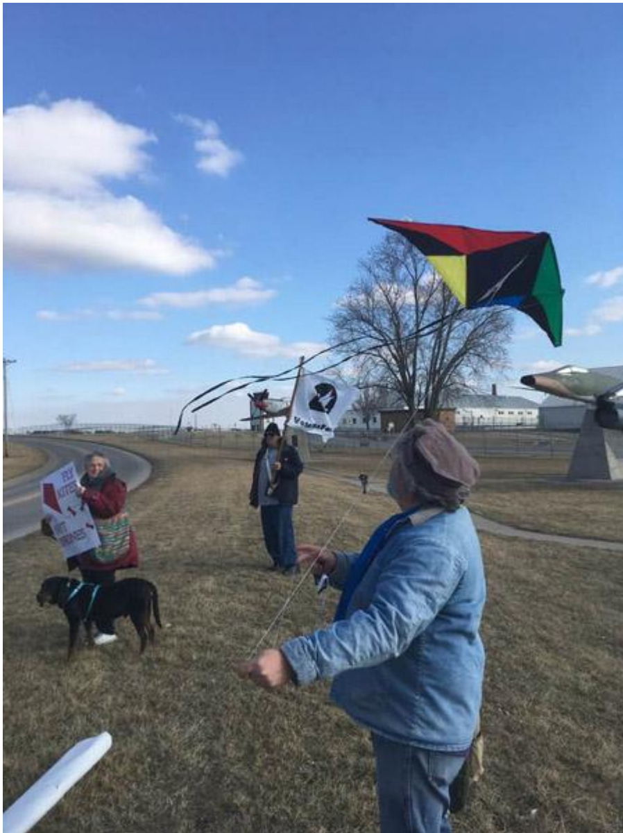
Activists fly kites at a Fly Kites Not Drones event March 21 at the Iowa Air National Guard base.

UNITED KINGDOM — Peace activists in the United Kingdom, including the London Catholic Worker and Pax Christi, called on groups around the world to join them in hosting "Fly Kites Not Drones" events on or near Nowruz, the Persian new year, March 21.