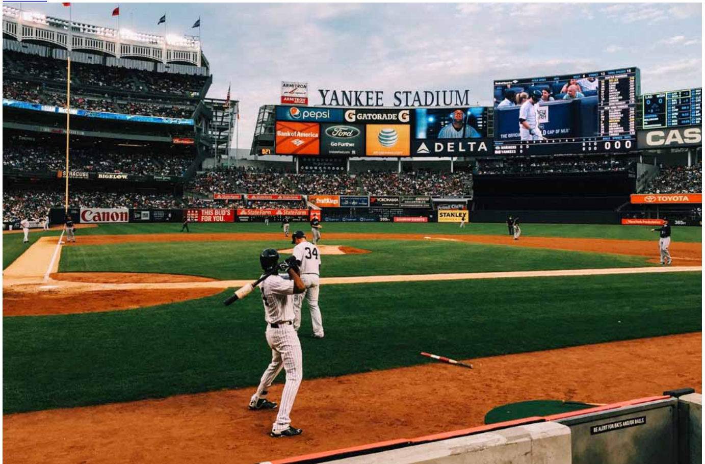
Yankee Stadium, in the Bronx borough of New York City