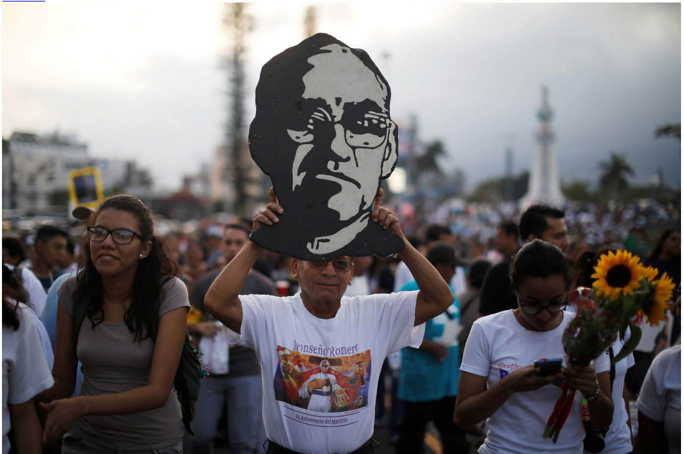
A man carries an image of Blessed Oscar Romero during a March 18 procession in San Salvador, El Salvador, to commemorate the 38th anniversary his murder.