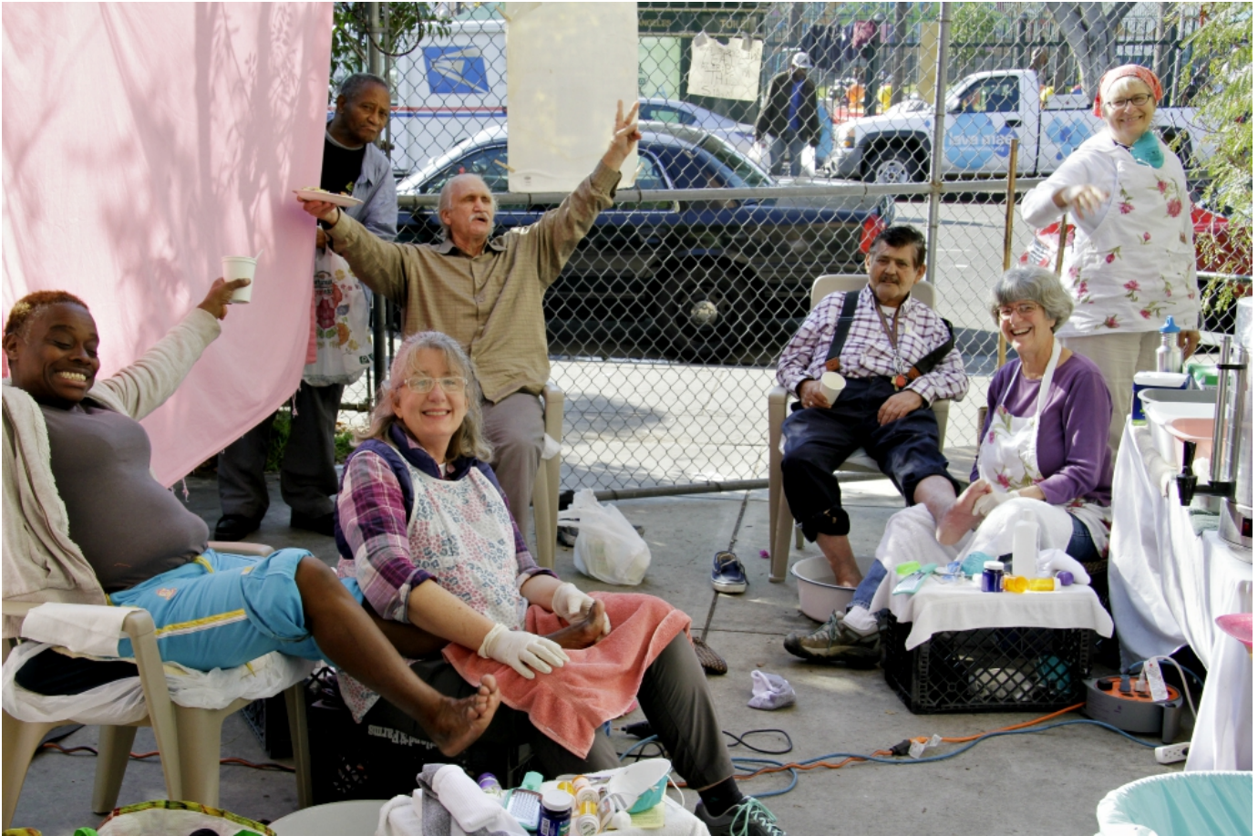
Volunteers provide foot care for patients during one of the Los Angeles Catholic Worker's weekly health outreach days. (Michael Wisniewski)

to do what we can do to address these problems and set an example to better society."