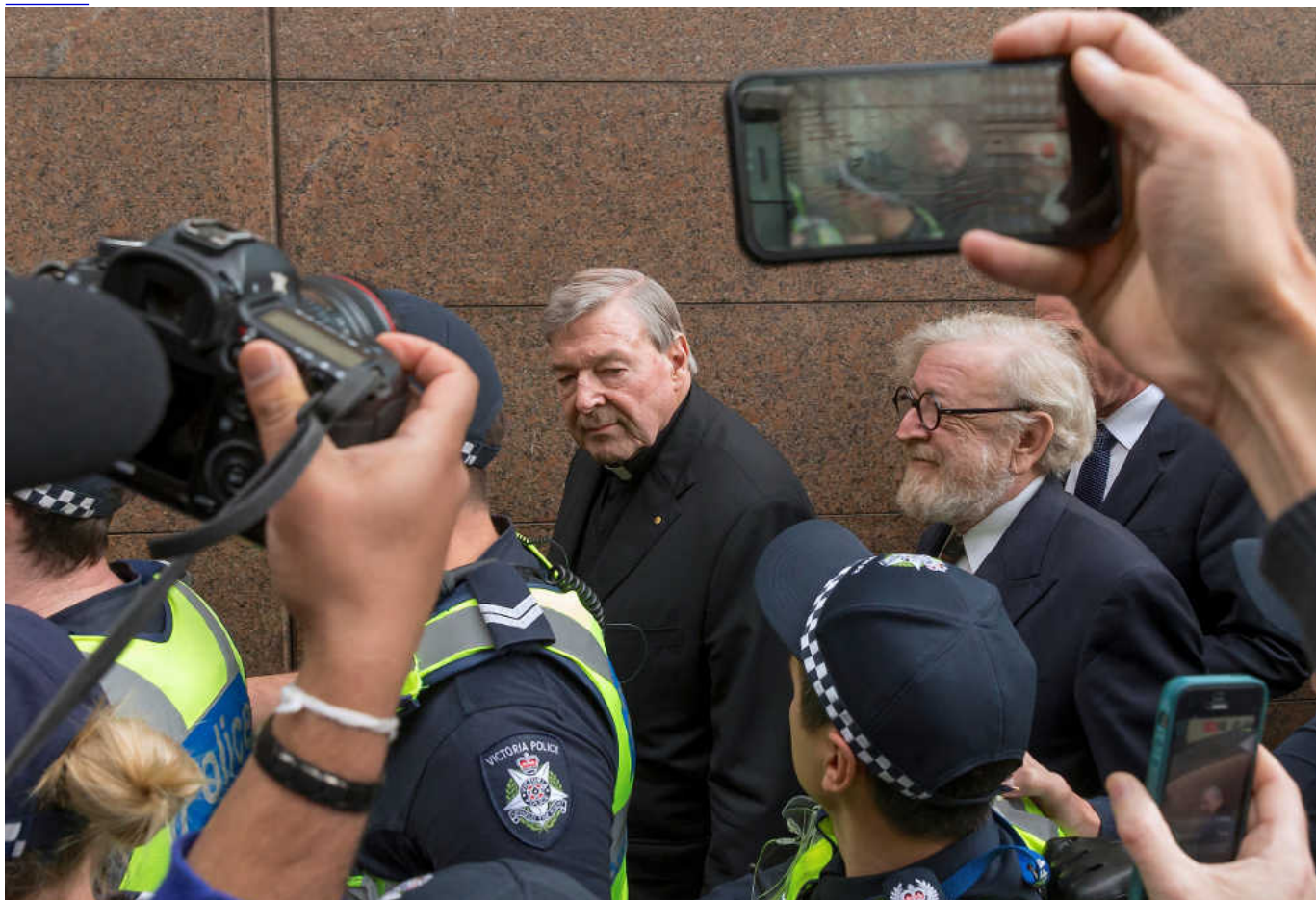
Australian Cardinal George Pell leaving the Melbourne Magistrates' Court in Australia July 26, 2017.