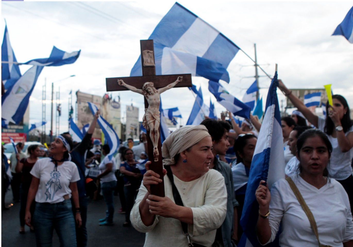
A demonstrator holds a crucifix during a protest against Nicaraguan President Daniel Ortega's government in Managua, Nicaragua, May 15.