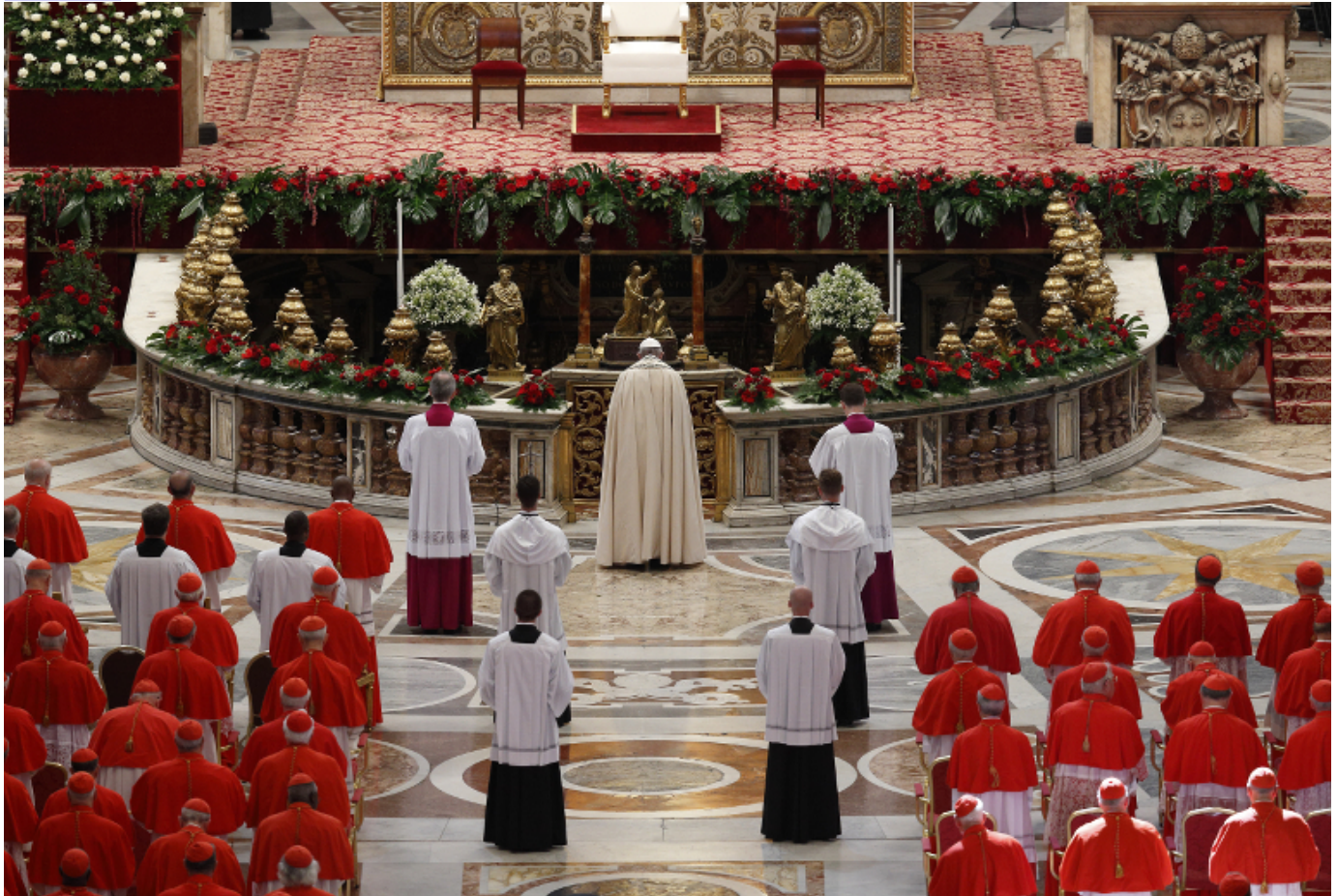
Pope Francis prays in St. Peter's Basilica during the 2017 consistory in which he created five new cardinals