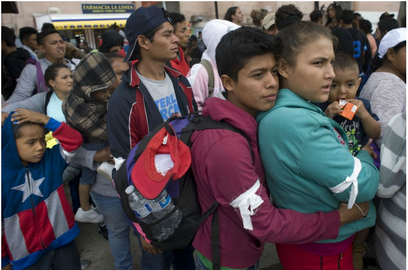
Central Americans wait to present themselves for asylum at the U.S.-Mexico border crossing April 29 in Tijuana, Mexico.

As documented in a Joint Complaint on Forcible Separation of Families in Customs and Border Protection Custody from several immigrant rights organizations, during this separation it can be very difficult for parents to learn where their children are and even more difficult to communicate with them. This can complicate court cases when some family members have documents or information that others need, said Feasley.