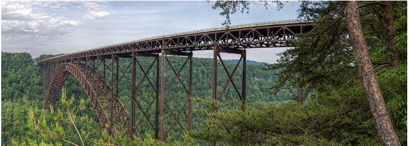
The New River Gorge Bridge in West Virginia

These books come at just the right time as Appalachia continues to play a role in national debates around race, poverty, labor, energy and diversity, and as new regional movements seem to be strengthening. Each gives deep historical context and summarizes the issues at stake for people on the ground working for justice, but finds its central purpose in helping to dismantle the harmful stories that still get in the way. Each is accessible and will find audiences far beyond insular Appalachian scholar and activist circles, while making contributions to scholarly debates, pushing beyond and even challenging some familiar tropes within the discourse.