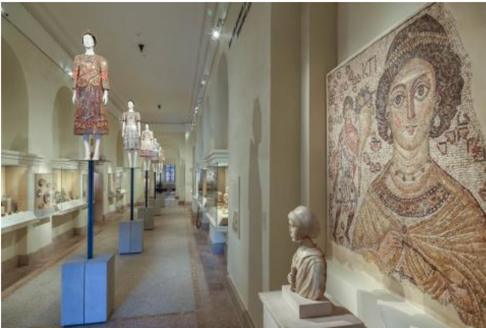
The Mary and Michael Jaharis Galleries for Byzantine Art (The Metropolitan Museum of Art)

On either side are seven mannequins solemnly shoulder to shoulder in costumes inspired by the soutanes worn by priests and the same number responding to the habits of religious women. Further on is a billowing, over the top wedding ensemble by Yves Saint Laurent (1977-78) with angelic wings that are echoed by another wedding ensemble from John Galliano (2005-6) inspired by the Cuzco School in Peru