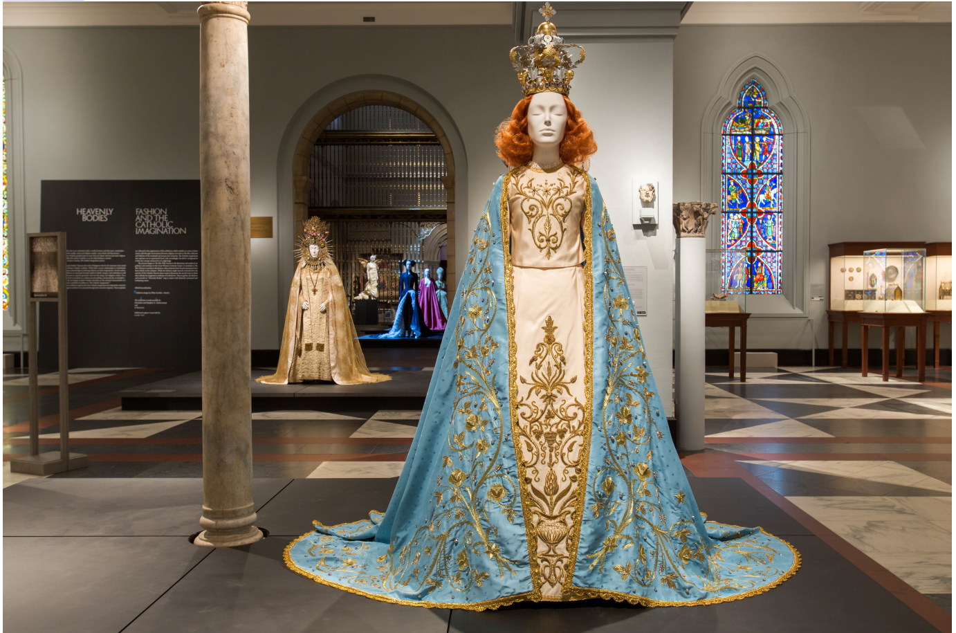
Costumes on display in the Metropolitan Museum's Medieval Europe Gallery