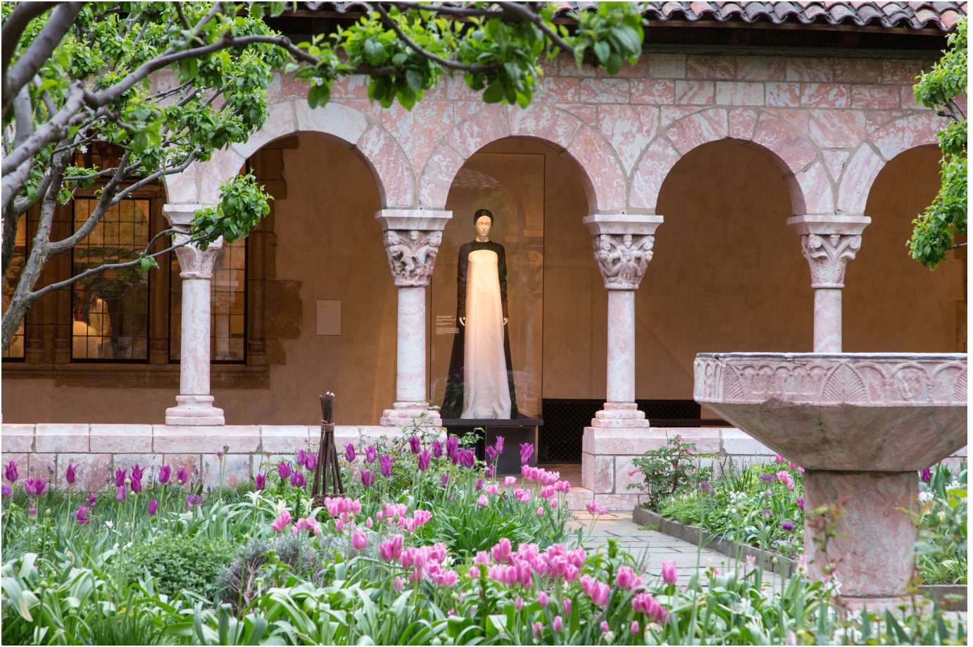
The Cuxa Cloister at the Met Cloisters in upper Manhattan (Metropolitan Museum of Art)

Two similarly columnar ensembles by Pierpaolo Piccioli for Valentino (2017-18) were inspired by the paintings of the 17th century Spanish master, Francisco de Zurbarán. Balenciaga, represented by an evening cape and a raincoat, is said also to have been influenced by Zurbarán, though he never himself claimed that. And for simple but luxurious elegance, almost nothing can match the cascading, hooded cape or two wide-sleeved evening dresses, one in black, the other light brown, by Madame Grès (from the 1960s).