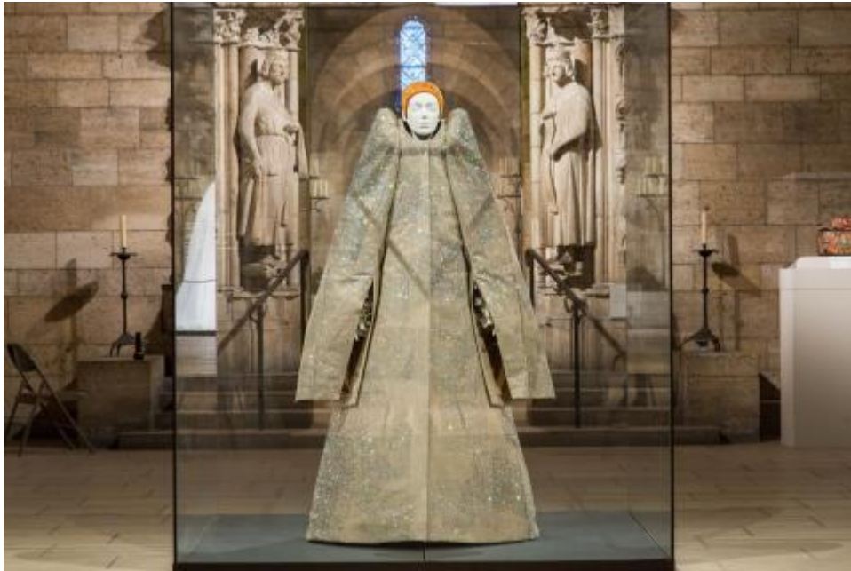
The Romanesque Hall at the Met Cloisters (The Metropolitan Museum of Art)

Bolton has said that "ostensibly the show is about Catholic imagery, but fundamentally it's about creativity and what drives creativity." I expect he has in mind the creativity of fashion. But a further chapter might also consider the creativity of the church inspired by the Holy Spirit. With its cornerstone in the Vatican Collection, "Heavenly Bodies" almost inevitably has an ultramontanist cast. (The popes chiefly represented are Leo XIII and, especially, Pius IX.)