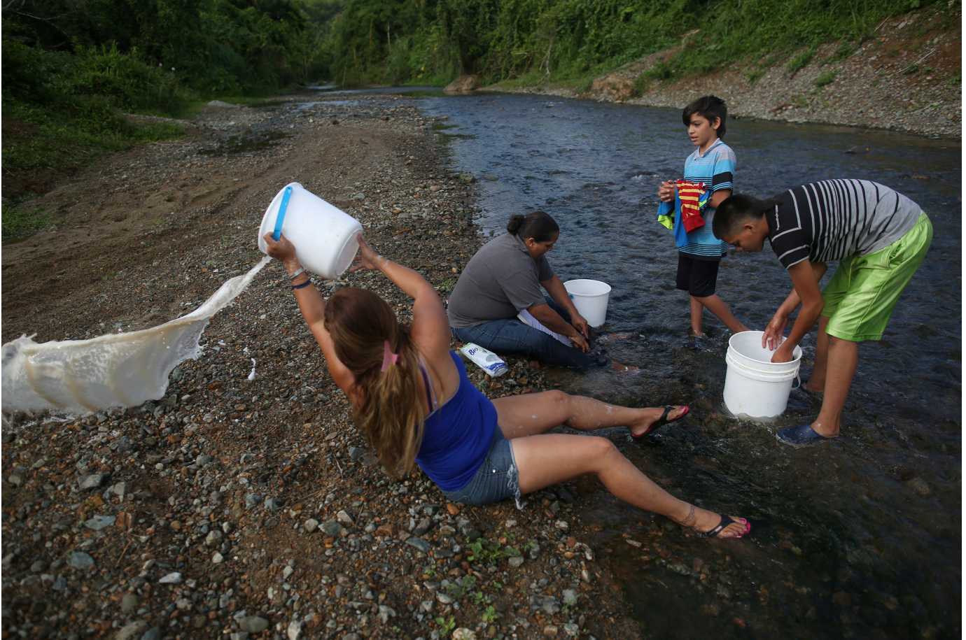
Residents wash clothes in the river in Adjuntas, Puerto Rico, May 11. The island is still reeling from the devastation caused by Hurricane Maria eight months ago.